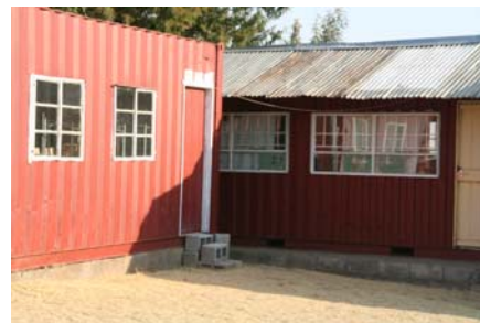
Above is a picture of the Maluti Seventh-day Adventist School in Lesotho. Fundraising will go towards building a new school. The building on the left is a steel storage container with windows and doors cut out.