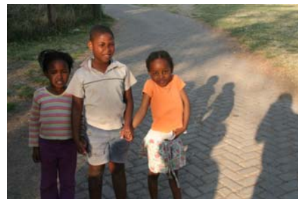
Three orphans who stole our hearts because of the love they showed for one another.