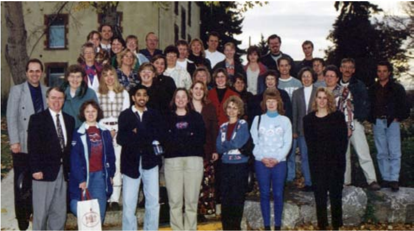
● Manitoba-Saskatchewan Conference