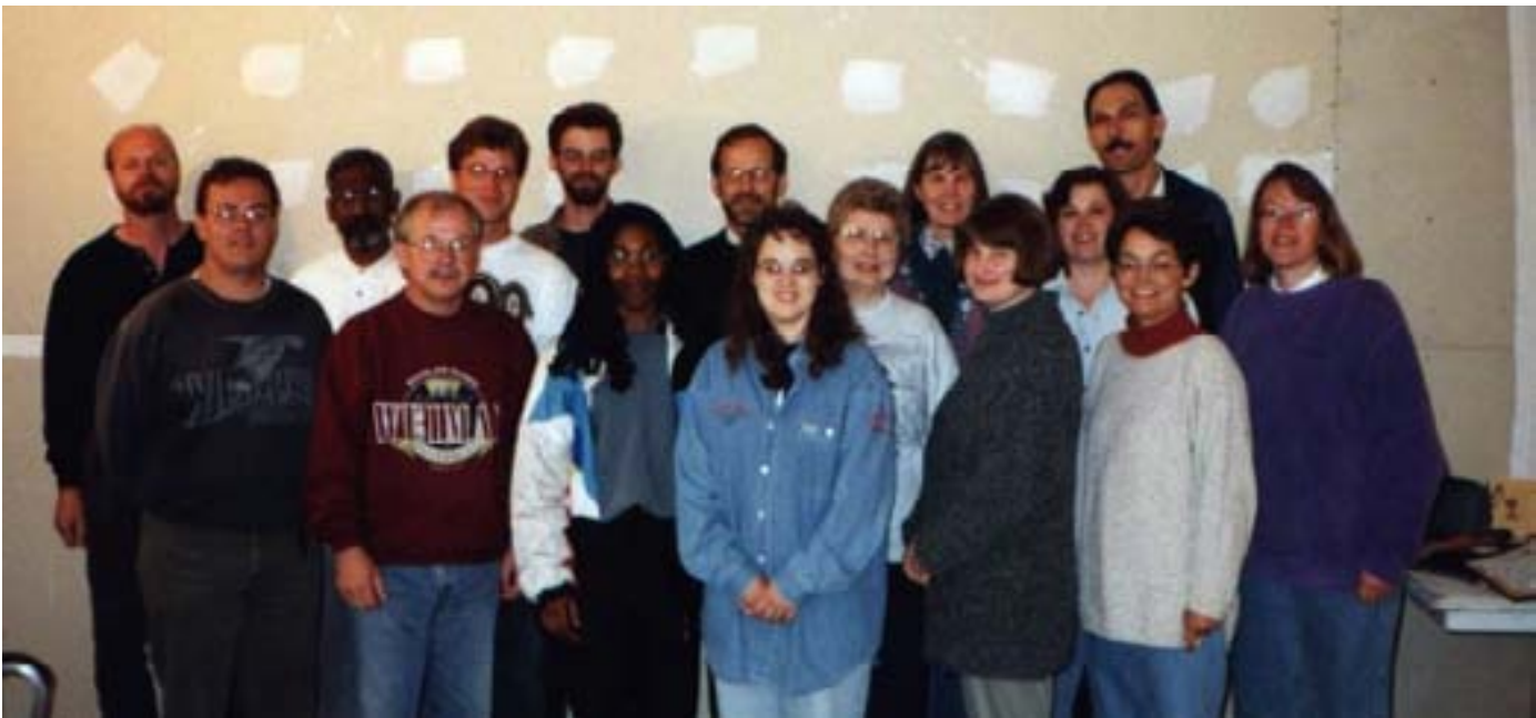
● Ontario Conference